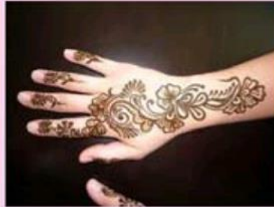
Indian Tattoo / Henna / Mehendi